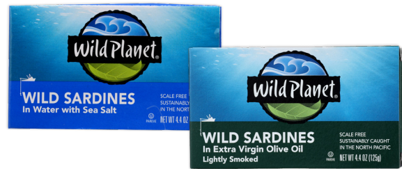
Wild Planet Wild Sardines selected varieties

Wild Planet uses the highest sustainable fishing methods to ensure our oceans provide for future generations. From catch to can, Wild Planet's minimal processing techniques and abundant care help maintain the purity nature intended so that we may provide you and your family with delicious, nutritious seafood you can trust.